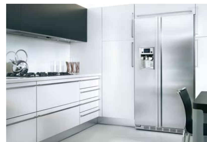
Example of GCE21XGYFNB with customized stainless steel doors.

* Note that not all features are available on all models. Please see the product specifications for details.